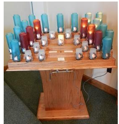
St. Andre's Chapel St. Joseph's Oratory