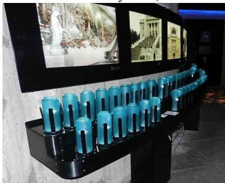
St. Joseph's Oratory Montreal

A new and innovative service is the introduction of Gabriel, an APP to light a 5-day votive candle at a location that has a Vendalite system, from anywhere in the world. This means that a mourner may light a candle for someone in a remembrance at a Funeral Home that has an electronic candle system, as an intention of remembrance.