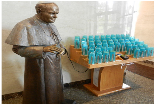
Pope John Paul Mausoleum, Detroit Diocese