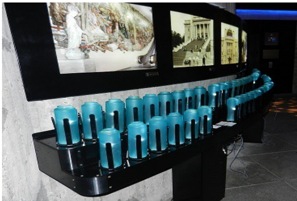
St. Joseph's Oratory, Montreal

Spending available funds wisely is a priority of everyone. In only making electronic candles and Gabriel available to parishioners does an investment ensure a return on costs.